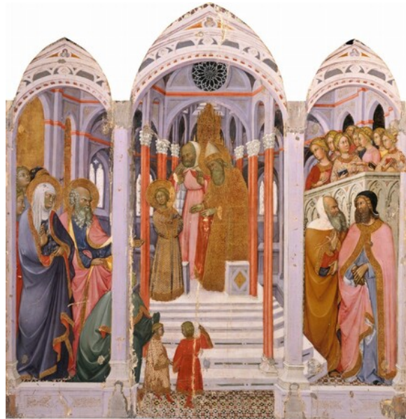
fig. 2 Photograph during treatment, before inpainting, Paolo di Giovanni Fei, The Presentation of the Virgin in the Temple , 1398–1399, tempera on panel transferred to hardboard, National Gallery of Art, Washington, Samuel H. Kress Collection