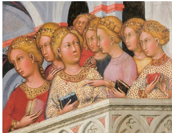
fig. 2 Detail of girls in the singing gallery, Paolo di Giovanni Fei, The Presentation of the Virgin in the Temple , 1398–1399, tempera on panel transferred to hardboard, National Gallery of Art, Washington, Samuel H. Kress Collection