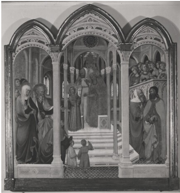
fig. 1 Archival photograph, c. 1950, Paolo di Giovanni Fei, The Presentation of the Virgin in the Temple , 1398–1399, tempera on panel transferred to hardboard, National Gallery of Art, Washington, Samuel H. Kress Collection