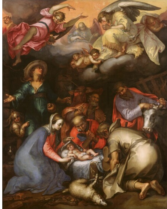
fig. 2 Abraham Bloemaert, The Adoration of the Shepherds , 1612, oil on canvas, Musée du Louvre, Paris.