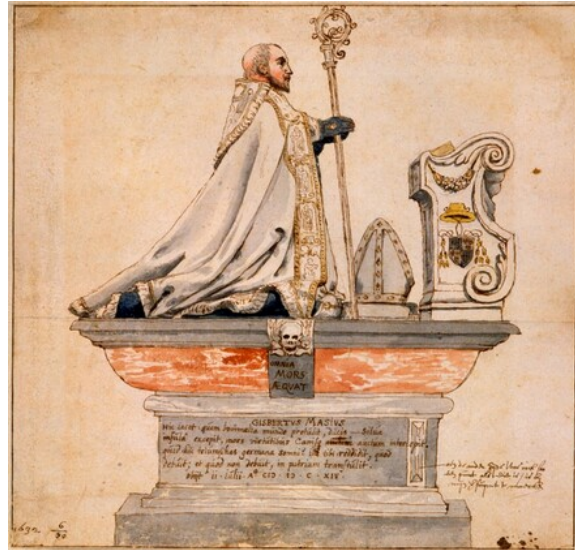
fig. 4 Pieter Jansz Saenredam, Tomb of Bishop Gisbertus Masius , June 30, 1632, pen and ink and watercolor, Noordbrabants Museum, 's-Hertogenbosch