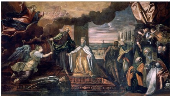
fig. 1 Jacopo Tintoretto and Workshop, Doge Alvise Mocenigo Attended by Saint Mark and Other Saints before the Redeemer , c. 1582, oil on canvas, Palazzo Ducale, Venice.