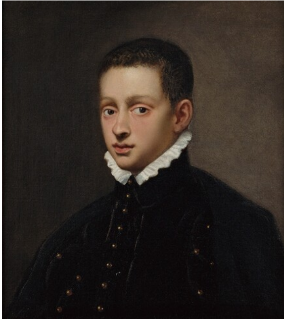
fig. 3 Jacopo Tintoretto, Portrait of a Boy , c. 1575, oil on canvas, Private Collection.