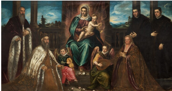
Jacopo Tintoretto Venetian, 1518 or 1519 - 1594