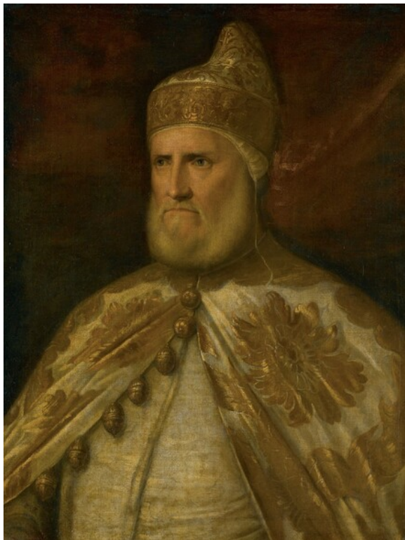
fig. 1 Workshop of Titian, Portrait of Doge Andrea Gritti , c. 1540, oil on canvas, Private Collection