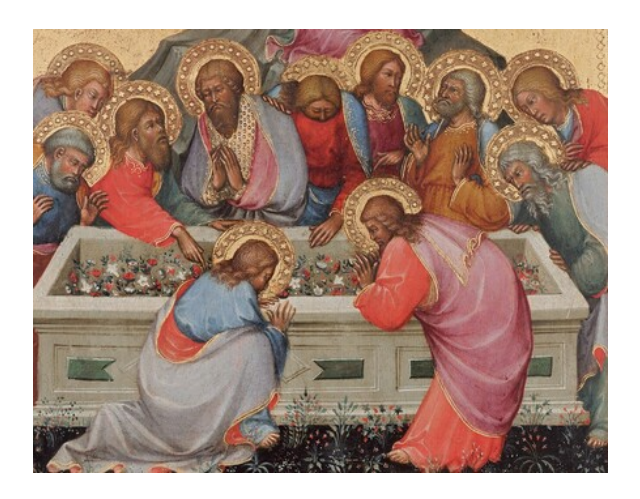
fig. 3 Detail of figures reacting to the miracle of the flowers in place of Mary's body, Paolo di Giovanni Fei, The Assumption of the Virgin with Busts of the Archangel Gabriel and the Virgin of the Annunciation , c. 1400/1405, tempera on panel, National Gallery of Art, Washington, Samuel H. Kress Collection