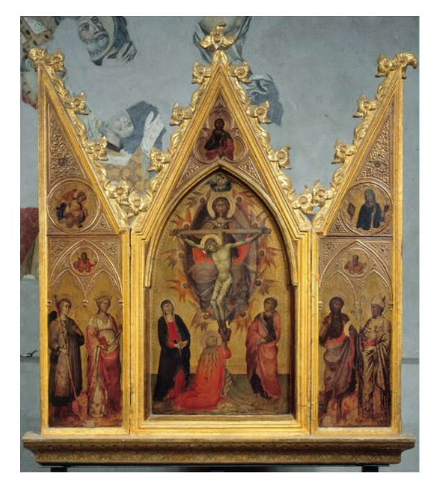
fig. 2 Paolo di Giovanni Fei, Triptych from the Minutolo Chapel, 1407–1408, tempera on panel, Naples Cathedral.