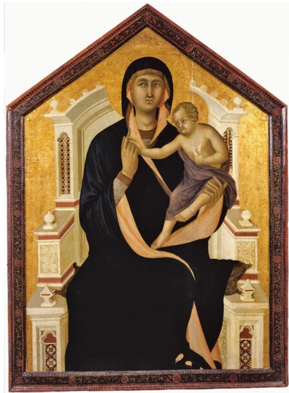
fig. 2 Master of Città di Castello, Maestà , c. 1300, tempera on panel, Pinacoteca Nazionale, Siena.