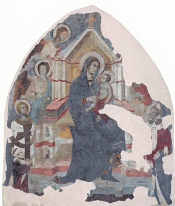
fig. 1 Sienese, Maestà , c. 1300, fresco, Chapel of Saint Nicholas, Collegiata, Casole d'Elsa