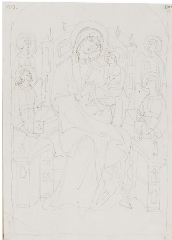
fig. 2 Johann Anton Ramboux, sketch of Maestà (Madonna and Child with Four Angels) , here attributed to the Master of Città di Castello, c. 1830–1840, Städelsches Kunstinstitut, Frankfurt