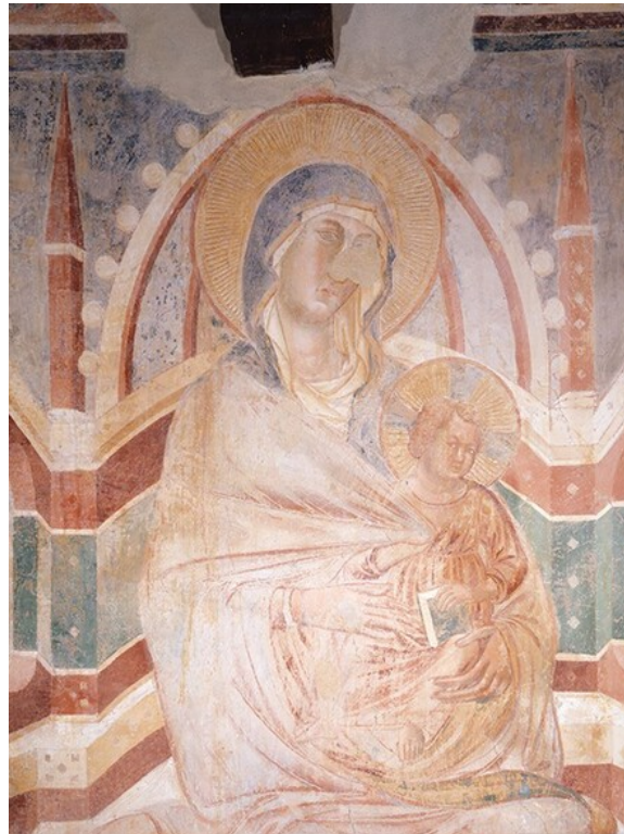
fig. 4 Siennese, Maestà , c. 1300, fresco, Church of San Lorenzo al Colle Ciupi at Monteriggioni.