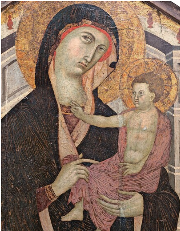
fig. 3 Detail of Madonna, Master of Città di Castello, Maestà (Madonna and Child with Four Angels) , c. 1290, tempera on panel, National Gallery of Art, Washington, Samuel H. Kress Collection