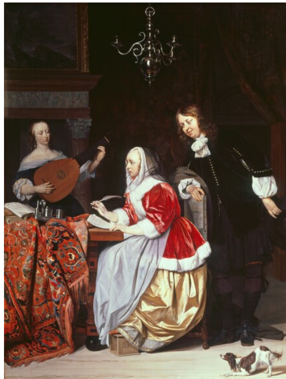
fig. 2 Gabriel Metsu, A Young Woman Composing Music , c. 1662-1663, oil on panel, Mauritshuis, The Hague