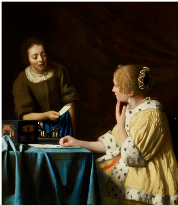
fig. 1 Johannes Vermeer, Mistress and Maid , c. 1667–1668, oil on canvas, Frick Collection, New York.