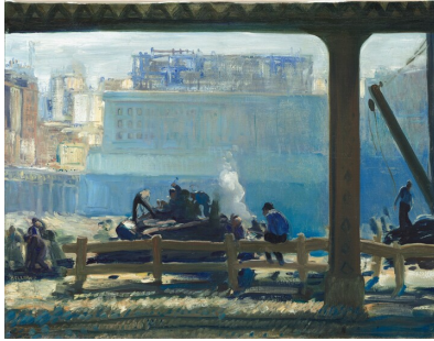
George Bellows American, 1882 - 1925