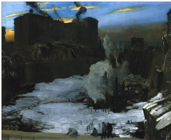
fig. 3 George Bellows, Pennsylvania Station Excavation , c. 1907–1908, oil on canvas, Brooklyn Museum of Art, A. Augustus Healy Fund