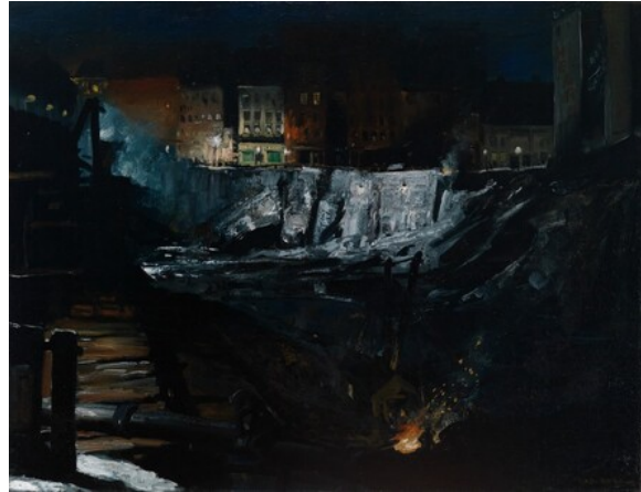
fig. 2 George Bellows, Excavation at Night , 1908, oil on canvas, Crystal Bridges Museum of Art