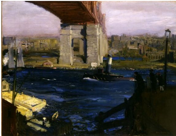
fig. 1 George Bellows, The Bridge, Blackwell's Island , 1909, oil on canvas, Toledo Museum of Art, Gift of Edward Drummond Libbey.