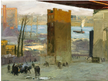
George Bellows American, 1882 - 1925