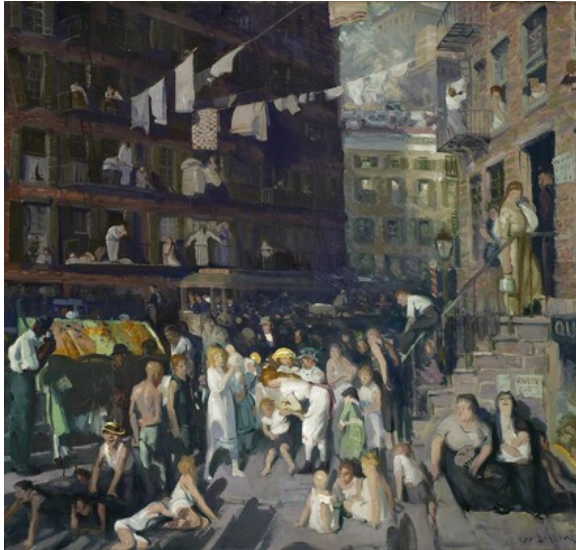
fig. 3 George Bellows, Cliff Dwellers , 1913, oil on canvas, Los Angeles County Museum of Art, Los Angeles County Fund (16.4)