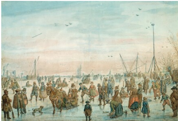
fig. 3 Hendrick Avercamp, Scene on Ice, c. 1620, watercolor, Staatliche Museen zu Berlin, Preussischer Kulturbesitz, Kupferstichkabinett, KdZ2230.