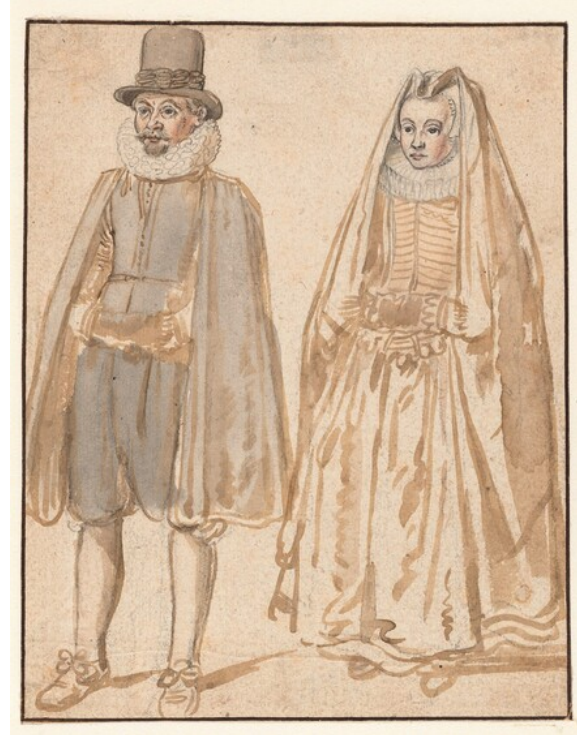
fig. 2 Hendrick Avercamp, Standing Couple , c. 1615, pen and ink and wash, Rijksprentenkabinet, Amsterdam, RP-T-1952-344. Photo © Rijksmuseum, Amsterdam