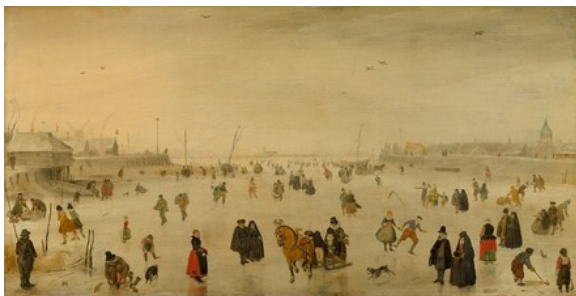
fig. 5 Hendrick Avercamp, A Scene on the Ice (pre-treatment), c. 1625, oil on panel, National Gallery of Art, Washington, DC, Ailsa Mellon Bruce Fund, 1967.3.1