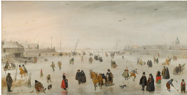
Hendrick Avercamp Dutch, 1585 - 1634