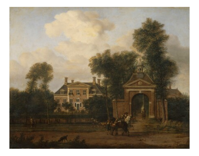
fig. 3 Jan van der Heyden, Harteveld on the Vecht , late 1660s, oil on canvas, Musée du Louvre, Paris.