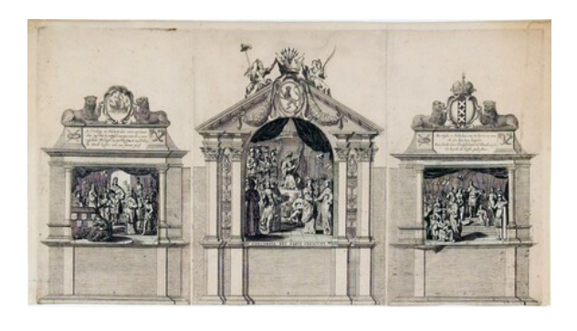
fig. 2 Engraving of a stage erected in 1648 on the Dam in Amsterdam to celebrate the Treaty of Münster, Atlas Van Stolk, Rotterdam