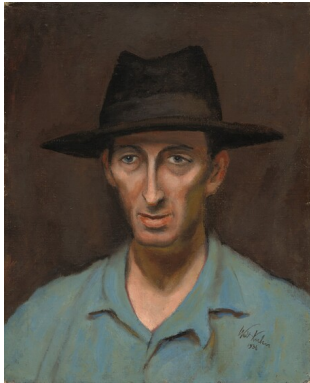
Walt Kuhn American, 1877 - 1949