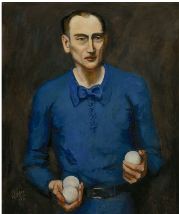
fig. 3 Walt Kuhn, Juggler , 1934, oil on canvas, The Nelson-Atkins Museum of Art, Kansas City, Gift of the Friends of Art, 38-1