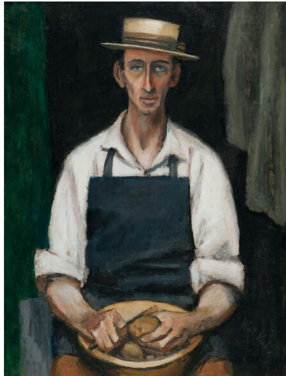
fig. 2 Walt Kuhn, The Camp Cook , 1931, oil on canvas, Munson-Williams-Proctor Institute, Utica.