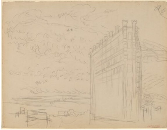
fig. 3 John Sloan, The City from Greenwich Village , c. 1922, graphite, National Gallery of Art, Washington, Gift of Helen Farr Sloan