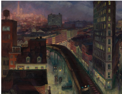
John Sloan American, 1871 - 1951