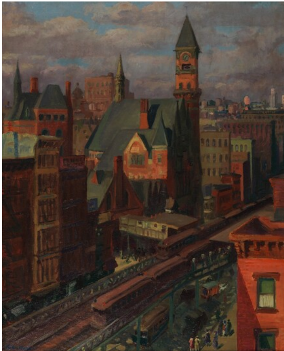
fig. 1 John Sloan, Jefferson Market, 1917, retouched 1922, oil on canvas, Pennsylvania Academy of the Fine Arts, Philadelphia.