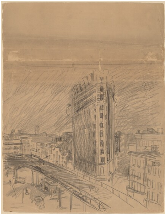
fig. 5 John Sloan, Study for "The City from Greenwich Village," II , c. 1922, graphite, National Gallery of Art, Washington, Gift of Helen Farr Sloan