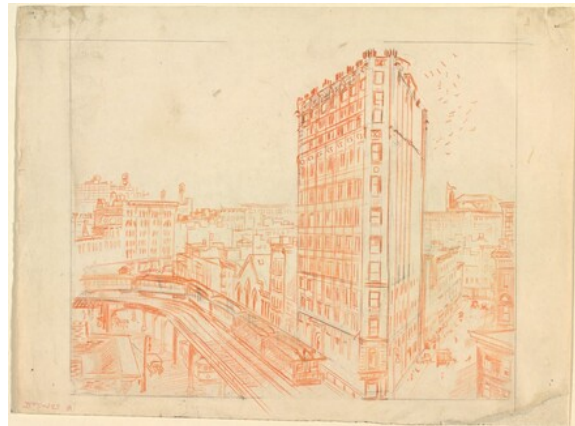
fig. 6 John Sloan, Study for "The City from Greenwich Village," III , c. 1922, red colored pencil with touches of graphite, National Gallery of Art, Washington, Gift of Helen Farr Sloan