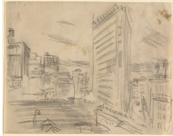
fig. 4 John Sloan, Study for "The City from Greenwich Village," I , c. 1922, graphite on tracing paper, National Gallery of Art, Washington, Gift of Helen Farr Sloan