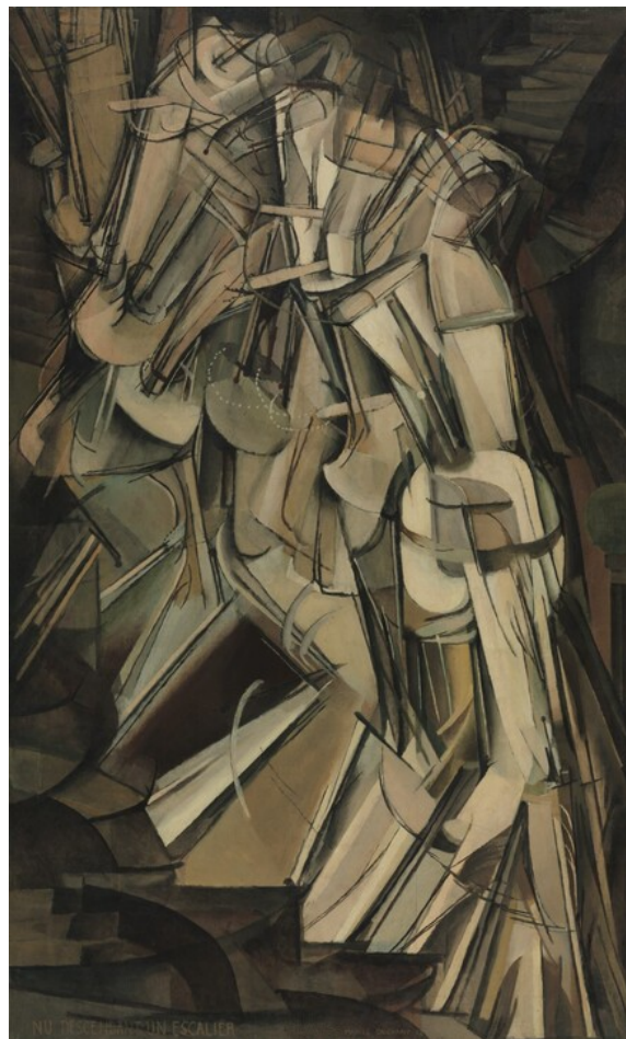
fig. 4 Marcel Duchamp, Nude Descending a Staircase, No. 2, 1912, oil on canvas, Philadelphia Museum of Art, The Louise and Walter Arensberg Collection 1950-134-59.