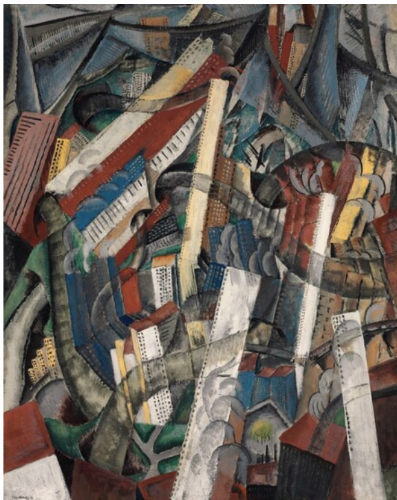
fig. 1 Max Weber, New York , 1913, oil on canvas, private collection.