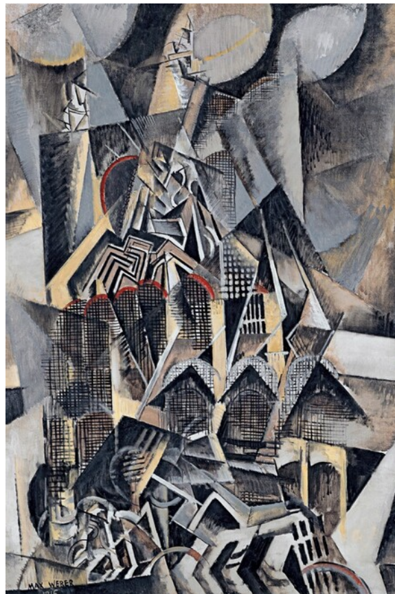
fig. 2 Max Weber, Grand Central Terminal , 1915, oil on canvas, Museo Thyssen-Bornemisza, Madrid. www.museothyssen.org