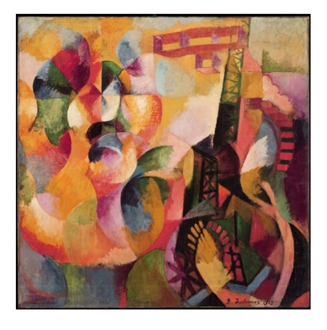
fig. 3 Robert Delaunay, Soleil, tour, Aeroplane , 1913, oil on canvas, Albright-Knox Art Gallery, Buffalo, A. Conger Goodyear Fund.