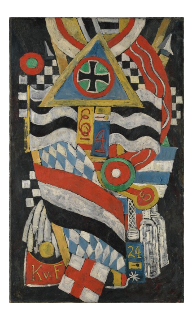
fig. 1 Marsden Hartley, Portrait of a German Officer , 1914, oil on canvas, The Metropolitan Museum of Art, New York, Alfred Stieglitz Collection, 1949