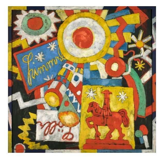
fig. 6 Marsden Hartley, Himmel, c. 1914–1915, oil on canvas, The Nelson-Atkins Museum of Art, Kansas City, Gift of the Friends of Art 56-118.