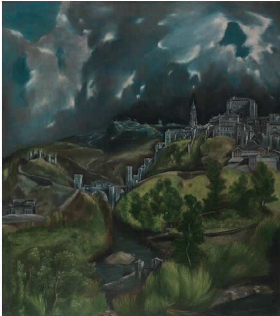
fig. 1 El Greco, View of Toledo , c. 1597, oil on canvas, The Metropolitan Museum of Art, New York. H. O. Havemeyer Collection, Bequest of Mrs. H. O. Havemeyer, 1929