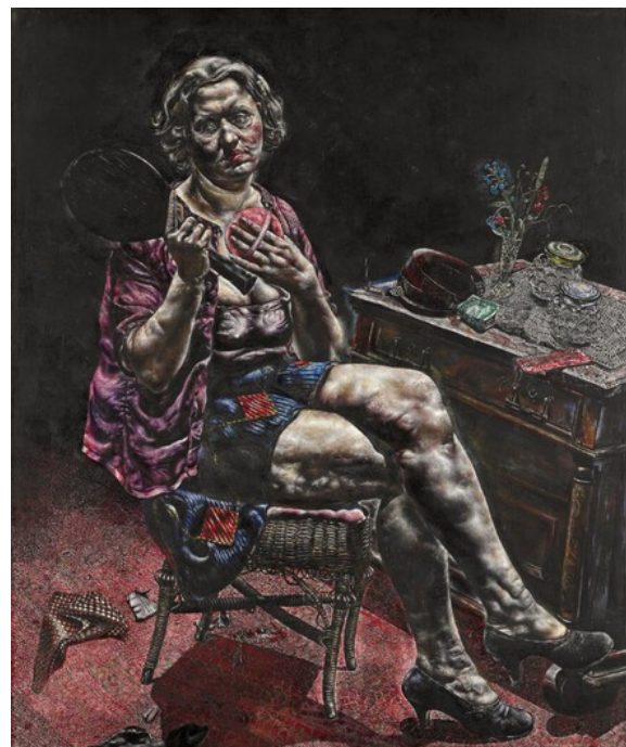
fig. 2 Ivan Albright, Into the World There Came a Soul Called Ida , 1929–1930, oil on canvas, The Art Institute of Chicago, 1977.34