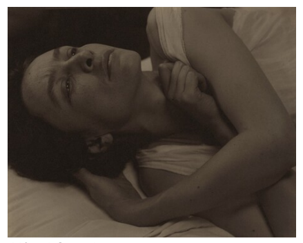
Alfred Stieglitz Georgia O'Keeffe possibly 1918 palladium print Key Set Number 520