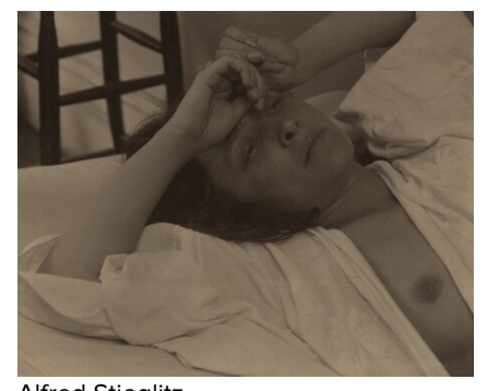
Alfred Stieglitz Georgia O'Keeffe probably 1918 palladium print Key Set Number 517

Alfred Stieglitz Georgia O'Keeffe possibly 1918 palladium print Key Set Number 521 same negative