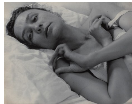
Alfred Stieglitz Georgia O'Keeffe probably 1918 platinum print Key Set Number 518