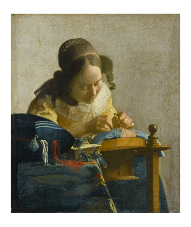
fig. 3 Johannes Vermeer, The Lacemaker, c. 1669–1670, oil on canvas (attached to panel), Musée du Louvre, Paris, inv. M.I. 1448.

Dutch Paintings of the Seventeenth Century