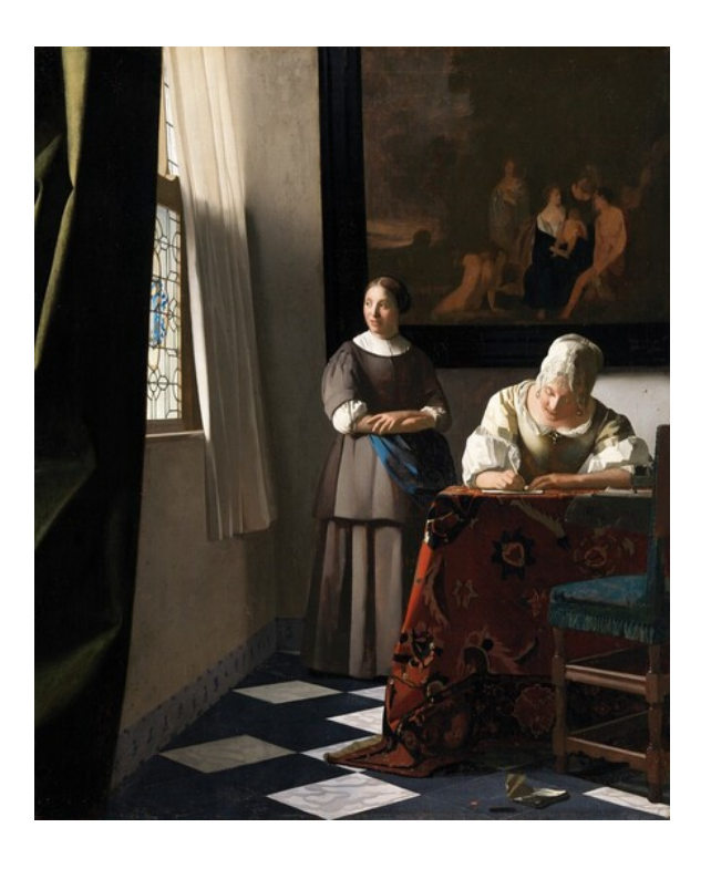
fig. 4 Johannes Vermeer, Woman Writing a Letter, with Her Maid, c. 1670, oil on canvas, National Gallery of Ireland, Presented, Sir Alfred and Lady Beit, 1987 (Beit Collection), NGI.4535.