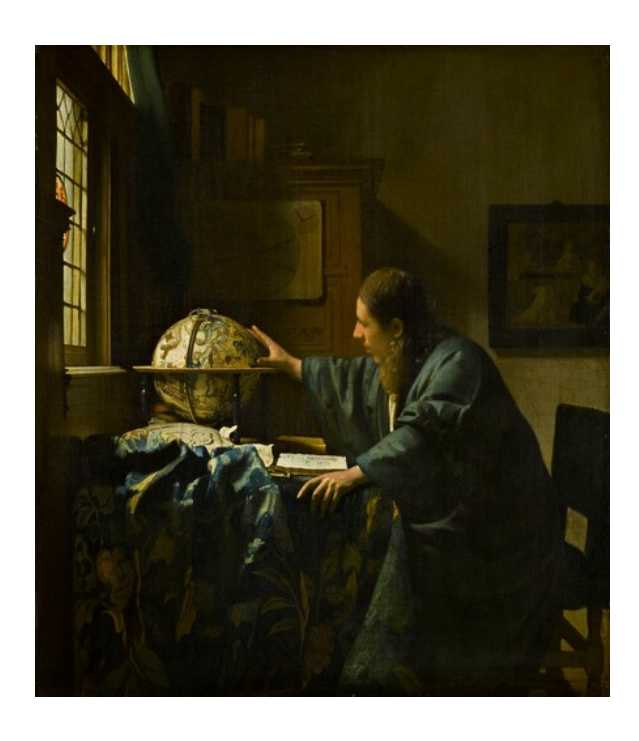
fig. 5 Johannes Vermeer, The Astronomer, 1668, Musée du Louvre, Paris, inv. RF 1983 28.

Dutch Paintings of the Seventeenth Century