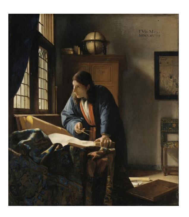
fig. 6 Johannes Vermeer, The Geographer, 1669, oil on canvas, Städel Museum, Frankfurt am Main, inv. 1149