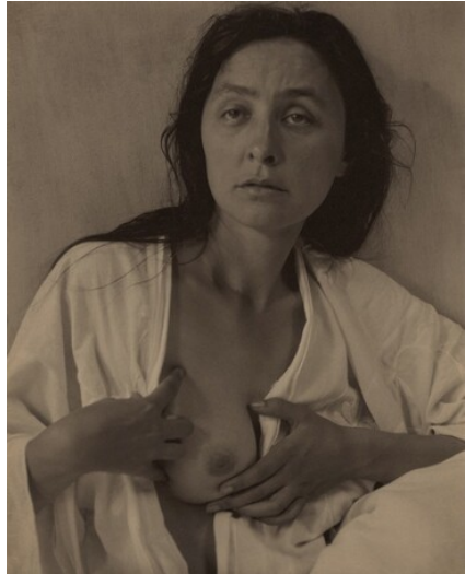
Alfred Stieglitz Georgia O'Keeffe 1918 palladium print Key Set Number 500