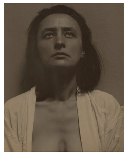
Alfred Stieglitz Georgia O'Keeffe 1918 palladium print Key Set Number 503