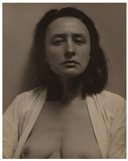
Alfred Stieglitz Georgia O'Keeffe 1918 palladium print Key Set Number 502