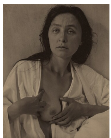
Alfred Stieglitz Georgia O'Keeffe 1918 palladium print Key Set Number 500