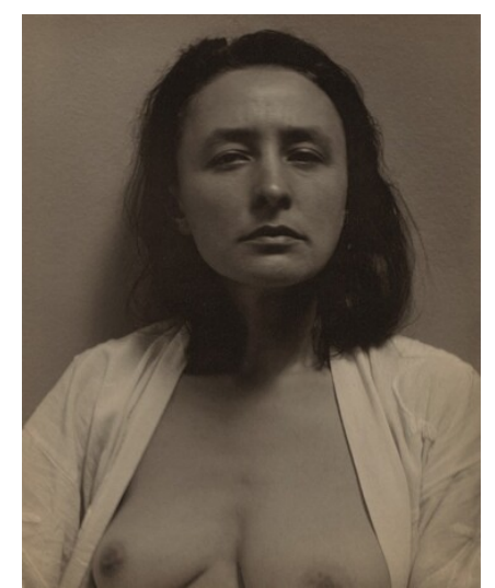
Alfred Stieglitz Georgia O'Keeffe 1918 palladium print Key Set Number 502