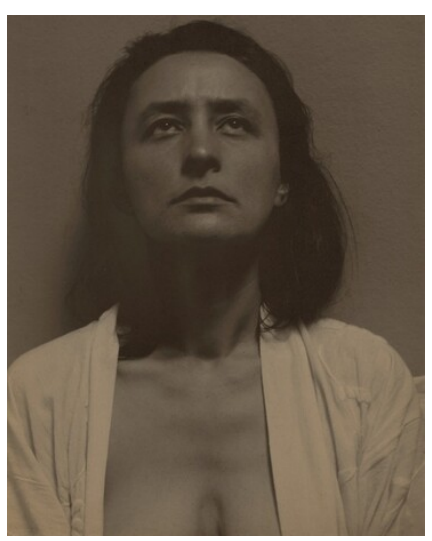
Alfred Stieglitz Georgia O'Keeffe 1918 palladium print Key Set Number 503