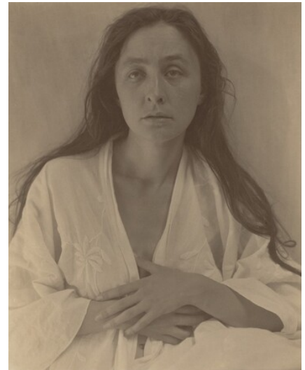
Alfred Stieglitz Georgia O'Keeffe 1918 palladium print Key Set Number 499