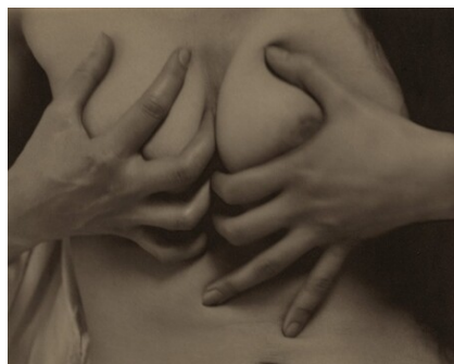
Alfred Stieglitz Georgia O'Keeffe—Hands and Breasts 1919 palladium print Key Set Number 580