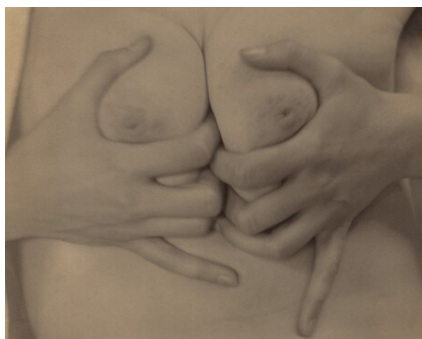
Alfred Stieglitz Georgia O'Keeffe—Hands and Breasts 1919 palladium print Key Set Number 578