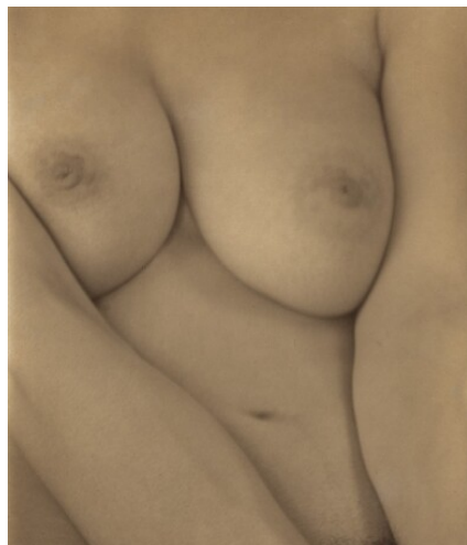
Alfred Stieglitz Georgia O'Keeffe—Breasts 1919 palladium print Key Set Number 574 same negative