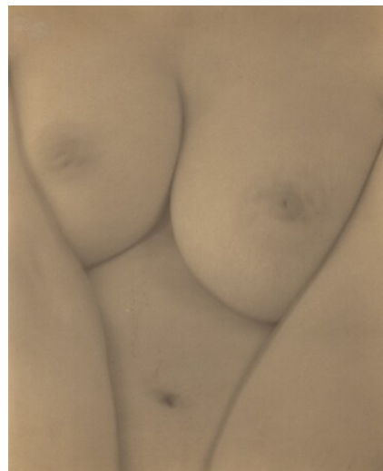
Alfred Stieglitz Georgia O'Keeffe—Breasts 1919 palladium print Key Set Number 577