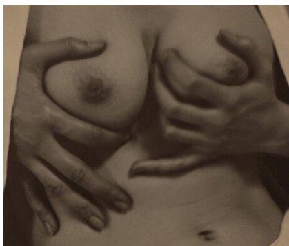
Alfred Stieglitz Georgia O'Keeffe—Hands and Breasts 1919 palladium print Key Set Number 579