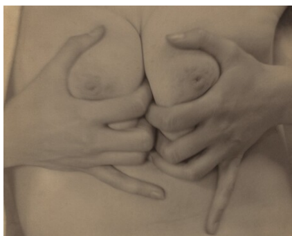
Alfred Stieglitz Georgia O'Keeffe—Hands and Breasts 1919 palladium print Key Set Number 578