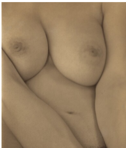
Alfred Stieglitz Georgia O'Keeffe—Breasts 1919 palladium print Key Set Number 574