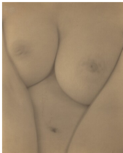
Alfred Stieglitz Georgia O'Keeffe—Breasts 1919 palladium print Key Set Number 577