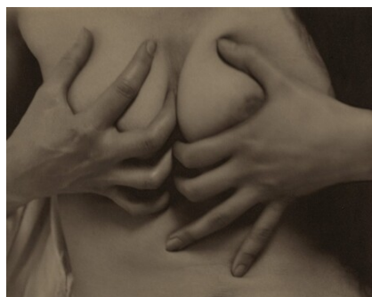
Alfred Stieglitz Georgia O'Keeffe—Hands and Breasts 1919 palladium print Key Set Number 580