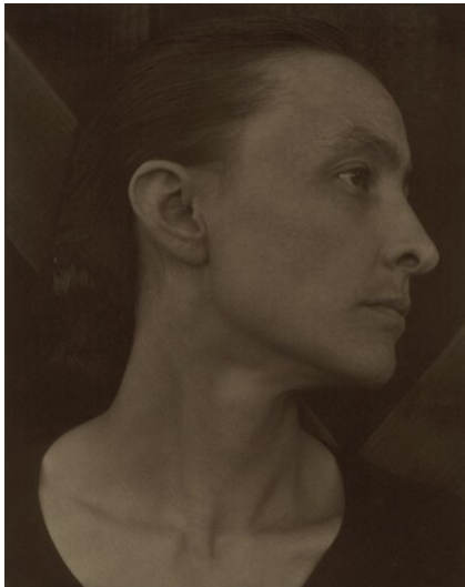
Alfred Stieglitz Georgia O'Keeffe 1921 palladium print Key Set Number 672 same negative