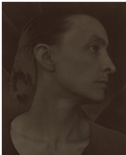
Alfred Stieglitz Georgia O'Keeffe 1921 palladium print Key Set Number 673