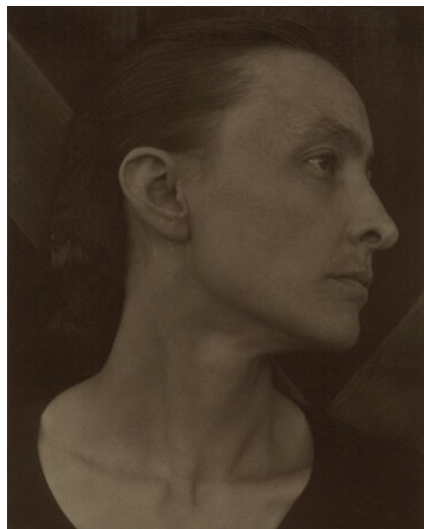
Alfred Stieglitz Georgia O'Keeffe 1921 palladium print Key Set Number 672