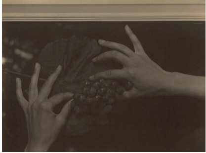
Alfred Stieglitz American, 1864 - 1946