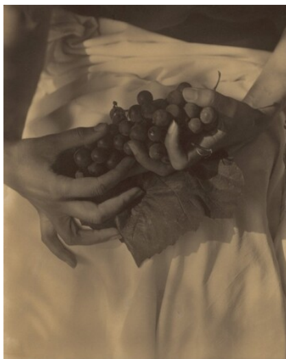
Alfred Stieglitz Georgia O'Keeffe—Hands and Grapes 1921 palladium print Key Set Number 679