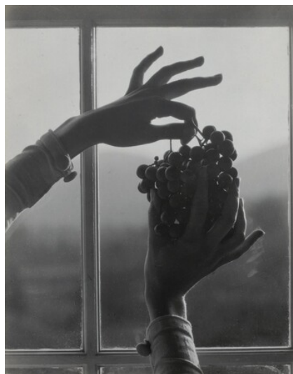
Alfred Stieglitz Georgia O'Keeffe—Hands and Grapes 1921 gelatin silver print Key Set Number 680