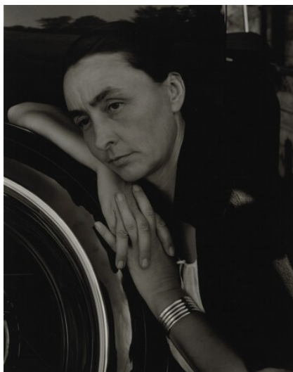
Alfred Stieglitz Georgia O'Keeffe 1933 gelatin silver print Key Set Number 1516