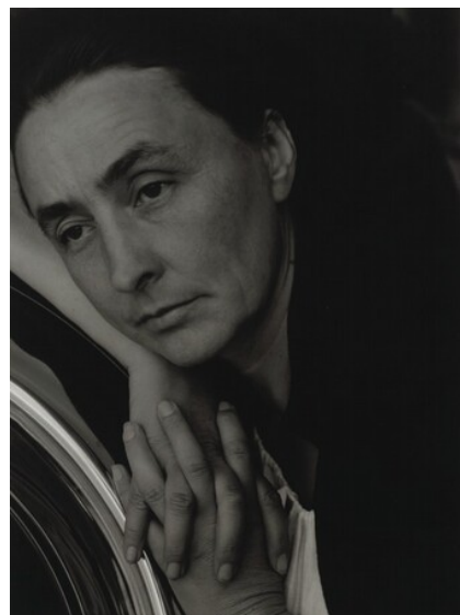
Alfred Stieglitz Georgia O'Keeffe 1933 gelatin silver print Key Set Number 1517