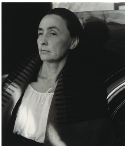
Alfred Stieglitz Georgia O'Keeffe 1933 gelatin silver print Key Set Number 1520