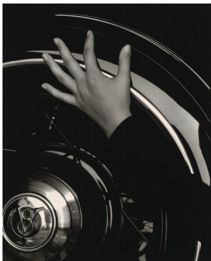
Alfred Stieglitz Georgia O'Keeffe—Hand and Wheel 1933 gelatin silver print Key Set Number 1515