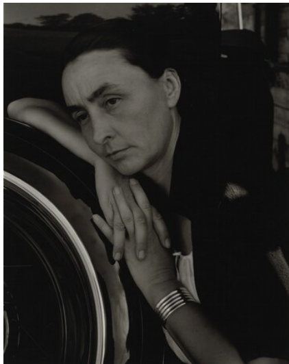
Alfred Stieglitz Georgia O'Keeffe 1933 gelatin silver print Key Set Number 1516