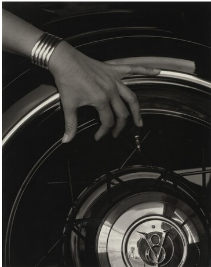
Alfred Stieglitz Georgia O'Keeffe—Hand and Wheel 1933 gelatin silver print Key Set Number 1519