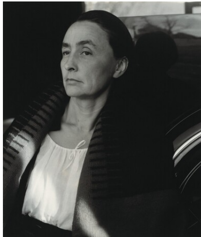
Alfred Stieglitz Georgia O'Keeffe 1933 gelatin silver print Key Set Number 1520

In summer 1933 O'Keeffe bought a new Ford V-8 convertible coupe. The spare wheel is seen in this photograph and Key Set numbers 1516, 1517, 1518, 1519, and 1520.