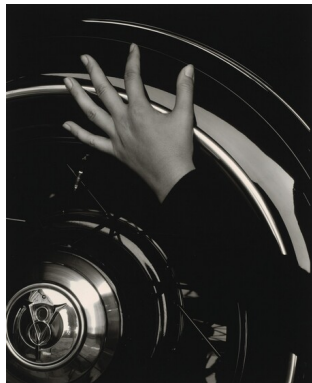
Alfred Stieglitz American, 1864 - 1946