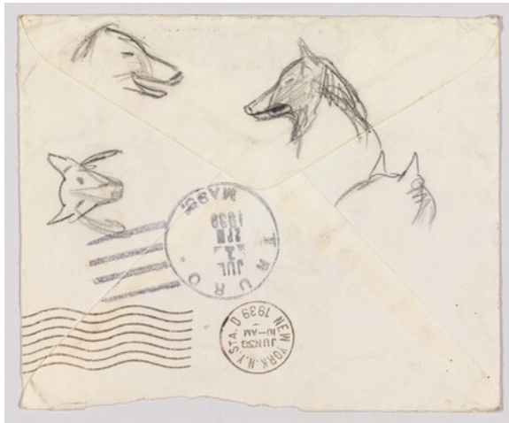
fig. 7 Edward Hopper, study for Cape Cod Evening , 1939, graphite pencil on paper, Whitney Museum of American Art, New York, Josephine N. Hopper Bequest 70.164. © Heirs of Josephine N. Hopper, licensed by the Whitney Museum of American Art