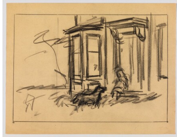
fig. 6 Edward Hopper, study for Cape Cod Evening , 1939, fabricated chalk on paper, Whitney Museum of American Art, New York, Josephine N. Hopper Bequest 70.180.