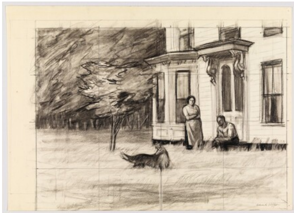
fig. 9 Edward Hopper, study for Cape Cod Evening , 1939, graphite pencil on paper, Whitney Museum of American Art, New York, Josephine N. Hopper Bequest 70.338. © Heirs of Josephine N. Hopper, licensed by the Whitney Museum of American Art