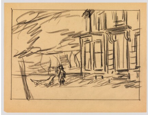
fig. 5 Edward Hopper, study for Cape Cod Evening , 1939, fabricated chalk on paper, Whitney Museum of American Art, New York, Josephine N. Hopper Bequest 70.181. © Heirs of Josephine N. Hopper, licensed by the Whitney Museum of American Art