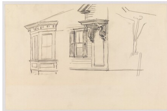
fig. 2 Edward Hopper, study for Cape Cod Evening , 1939, graphite pencil on paper, Whitney Museum of American Art, New York, Josephine N. Hopper Bequest 70.227.