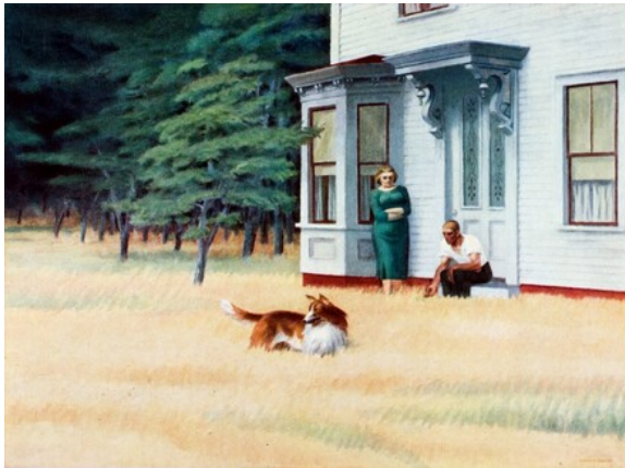
fig. 1 Edward Hopper, Cape Cod Evening , as reproduced in Contemporary American Painting: Encyclopedia Britannica Collection (New York, 1946), pl. 59. ND205, showing the original color of the pigment in the locust trees