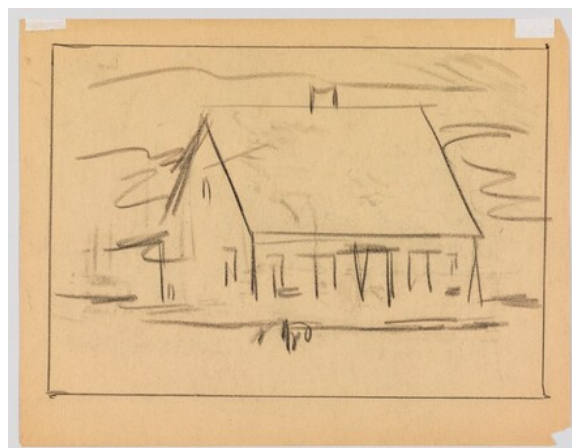
fig. 4 Edward Hopper, study for Cape Cod Evening , 1939, fabricated chalk on paper, Whitney Museum of American Art, New York, Josephine N. Hopper Bequest 70.183b. © Heirs of Josephine N. Hopper, licensed by the Whitney Museum of American Art