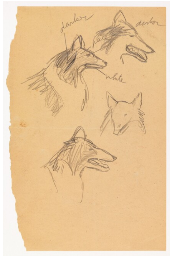
fig. 8 Edward Hopper, study for Cape Cod Evening , 1939, graphite pencil on paper, Whitney Museum of American Art, New York, Josephine N. Hopper Bequest 70.163.