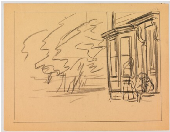
fig. 1 Edward Hopper, study for Cape Cod Evening , 1939, fabricated chalk on paper, Whitney Museum of American Art, New York, Josephine N. Hopper Bequest 70.182. © Heirs of Josephine N. Hopper, licensed by the Whitney Museum of American Art