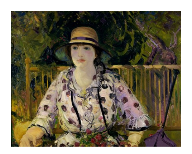
fig. 3 George Bellows, Emma in an Orchard , 1916, oil on canvas, Cummer Museum of Art & Gardens, Jacksonville. Purchased with funds from the Cummer Council, AP.1980.1.1.