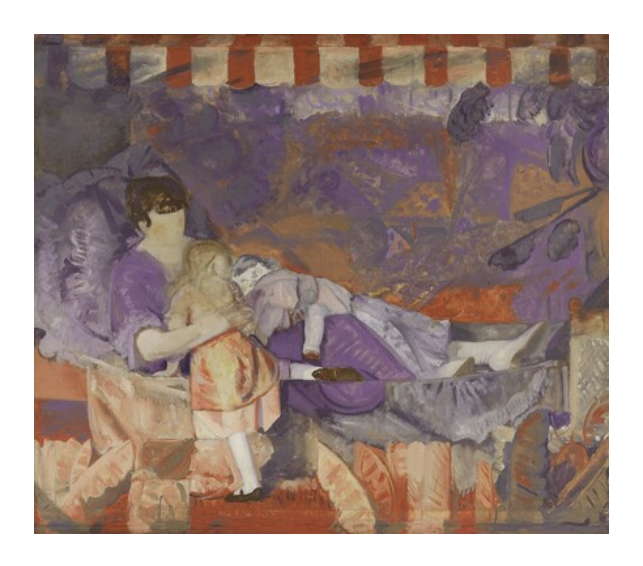
fig. 1 George Bellows, Study of Emma and the Children, 1917, oil on canvas, Museum of Fine Arts, Boston, A. Shuman Collection—Abraham Shuman Fund.