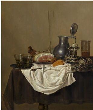
Gerret Willemsz Heda Dutch, active 1640s and 1650s