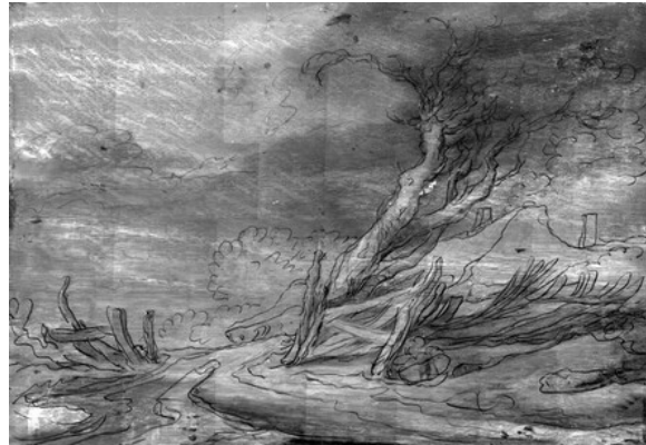
fig. 2 Infrared reflectogram, Pieter Molijn, Landscape with Open Gate , c. 1630/1635, oil on panel, National Gallery of Art, Washington, Ailsa Mellon Bruce Fund and Gift of Arthur K. and Susan H. Wheelock