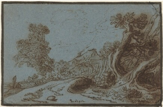
fig. 1 Pieter Molijn, Road between Trees near a Farm , 1626, pen and ink on blue paper, Rijksprentenkabinet, Amsterdam.