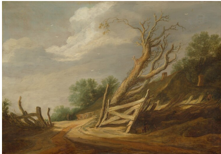
Pieter Molijn Dutch, 1595 - 1661