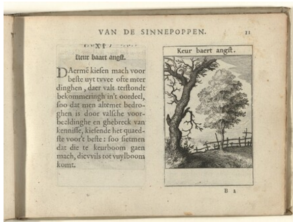
fig. 3 Roemer Visscher, “Keu baert angst,” emblem from Zinne-poppen , Amsterdam, 1614