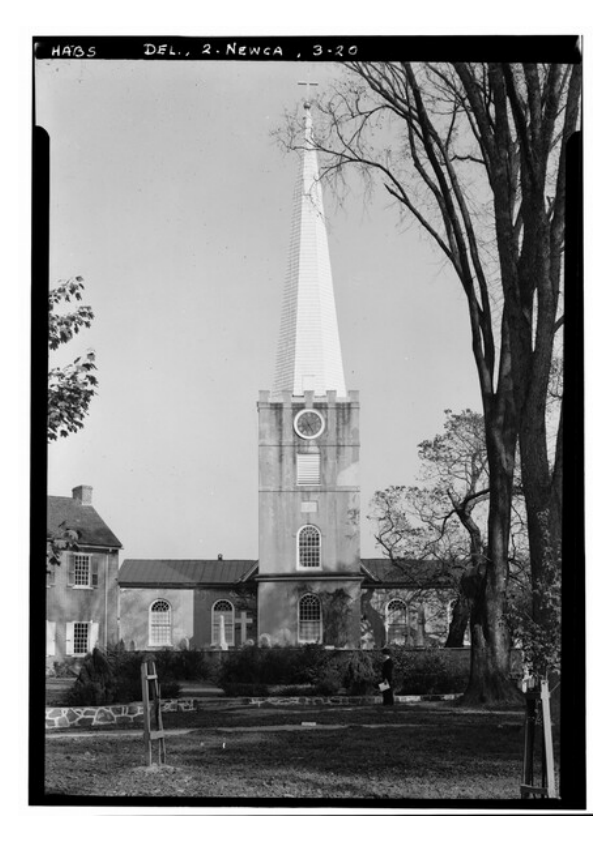
fig. 1 W. S. Stewart, West Facade—Immanuel Church ( Episcopal ), The Green, New Castle, New Castle County, DE , October 23, 1936, photograph, Library of Congress, Prints and Photographs Division, Washington, DC