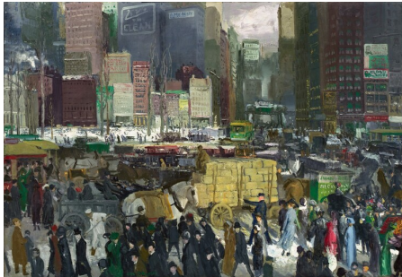
George Bellows American, 1882 - 1925