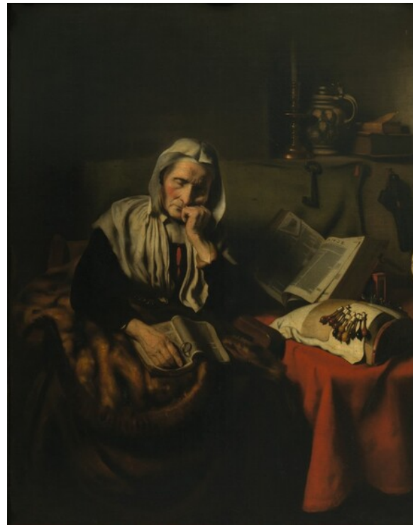
fig. 2 Nicolaes Maes, An Old Woman Asleep before a Bible , c. 1655, oil on canvas, Royal Museums of Fine Arts of Belgium, Brussels.