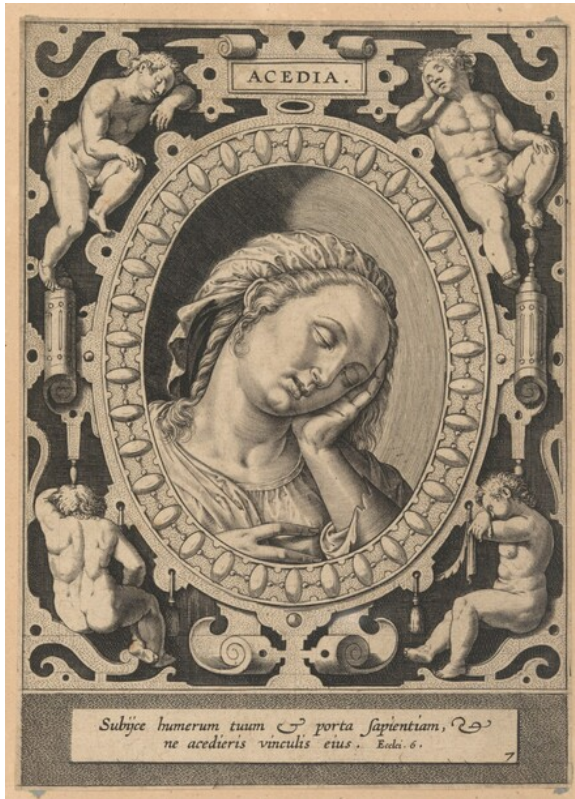
fig. 1 Jerome Weirix, after P. Galle, Acedia , engraving, Metropolitan Museum of Art, New York, Harris Brisbane Dick Fund, 1953.