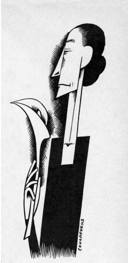
fig. 3 Miguel Covarrubias, "Our Lady of the Lily," illustration from New Yorker (July 6, 1929): 21.