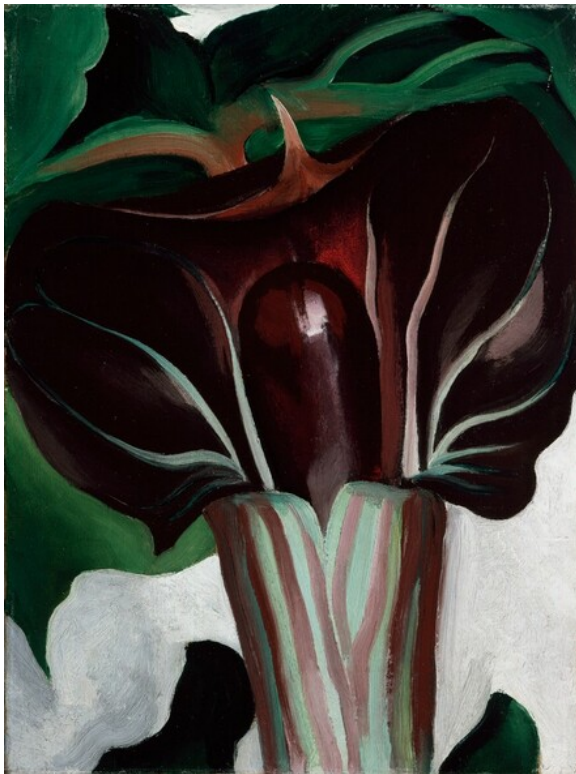
fig. 1 Georgia O’Keeffe, Jack-in-the-Pulpit No. 1 , 1930, oil on canvas, private collection, Los Angeles. © Georgia O’Keeffe Museum