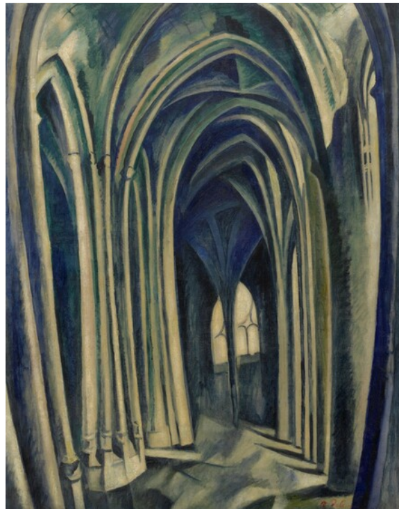
fig. 2 Robert Delaunay, Saint-Severin No. 3 , 1909–1910, oil on canvas, The Solomon R. Guggenheim Museum, New York, Founding Collection.