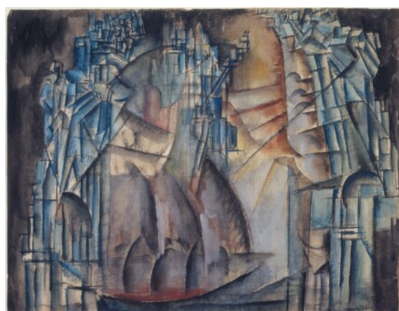
fig. 2 Max Weber, Interior of the Fourth Dimension , 1913, transparent and opaque watercolor over black crayon, Baltimore Museum of Art, Saidie A. May Bequest Fund, 1970.42.