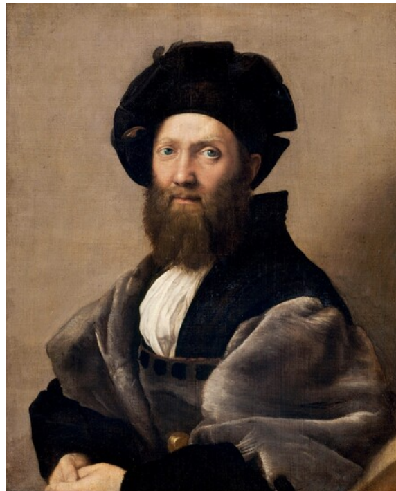
fig. 2 Raphael, Balthasar Castiglione , c. 1514–1515, oil on panel, Musée du Louvre, Paris.