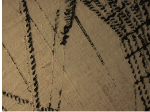
fig. 2 Detail photograph of raised lines, Willem van de Velde the Elder, Dutch Ships near the Coast , early 1650s, oil and ink on panel, National Gallery of Art, Washington, Gift of Lloyd M. Rives