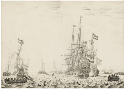
Willem van de Velde the Elder Dutch, 1611 - 1693