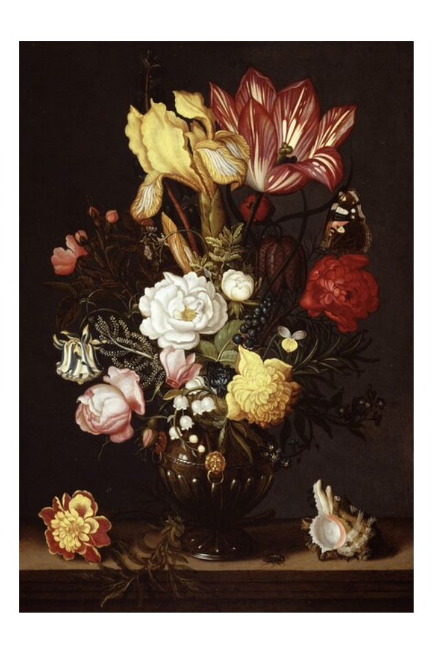
fig. 2 Ambrosius Bosschaert the Younger, Flowers in a Vase , 1627, oil on silver , private collection.