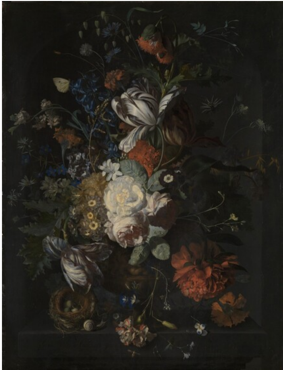
fig. 1 Jan van Huysum, Floral Still Life , 1714, oil on panel, Staatliche Kunsthalle, Karlsruhe.