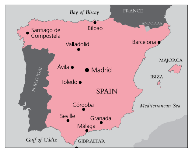
Map of modern Spain