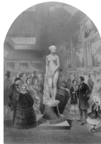
FIG. 2 Hiram Powers' Greek Slave on display at the Dusseldorf Gallery, New York. Engraving by R. Thew, nineteenth century.