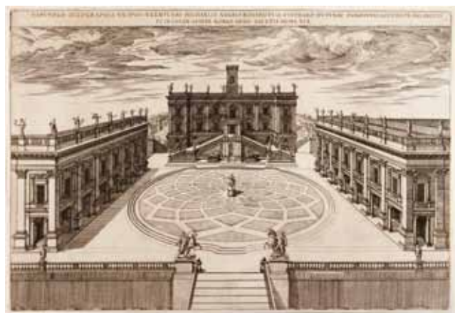
FIG. 3 The Capitoline Hill showing the Palace of the Senators in the center and the Palace of the Conservators at right. Anonymous drawing, mid-sixteenth century, Musée du Louvre, Paris.

Michelangelo was also charged with reorganizing the area, known as the Piazza del Campidoglio. He