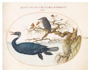
A Brandt's Cormorant with a Juvenile Crowned Night Heron (plate 23)