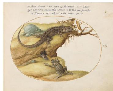
Two Sand Lizards, a Common Parsley Frog (?), and a Caterpillar (plate 51)