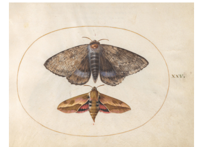
Blue Underwing Moth and Spurge Hawk Moth (plate 25)

Rotation 4: September 22–November 2, 2025