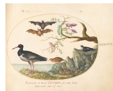
Bats, Quail, and Oystercatcher (?) by the Water (plate 46)