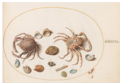
Two Crabs with Seashells (plate 46)