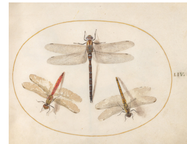
Hairy Dragonfly and Two Darters (plate 54)

Rotation 3: August 11–September 21, 2025