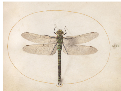
Southern Hawker Dragonfly (plate 53)