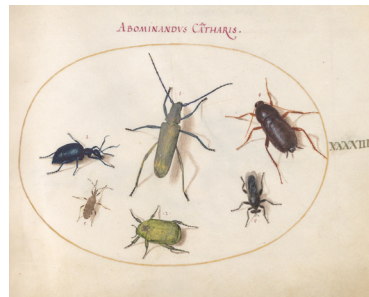
Musk Beetle, Oil Beetle, Tansy Beetle(?), Cockroach, Leaf-Footed Bug, and Other Insects (plate 43)

Rotation 3: August 11–September 21, 2025