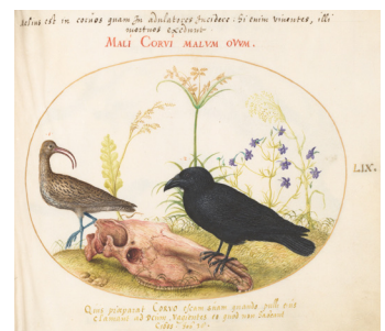
Curlew and Crow with Horse Skull (plate 59)