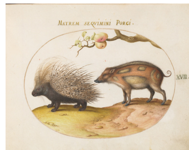
Old World Porcupine (Hystrix) and Wild Pig (plate 17)