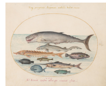
Sperm Whale, Sturgeon, Shark, and Other Fish (plate 2)