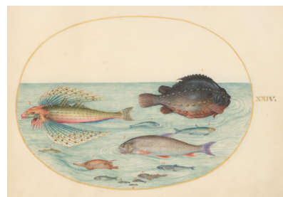
Flying Swallow Gurnard, Male Lumpsucker, Longspine Snipefish, and Other Fish (plate 24)