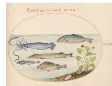
Squid, Gurnard, Pike, and Other Fish (plate 39)