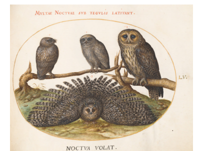
A Tawny Owl, an Eagle Owl, and Two other Owls (plate 55)