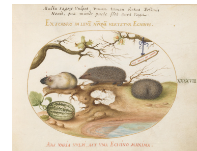
Guinea Pig and Hedgehogs with Melon and Cobnuts (plate 48)