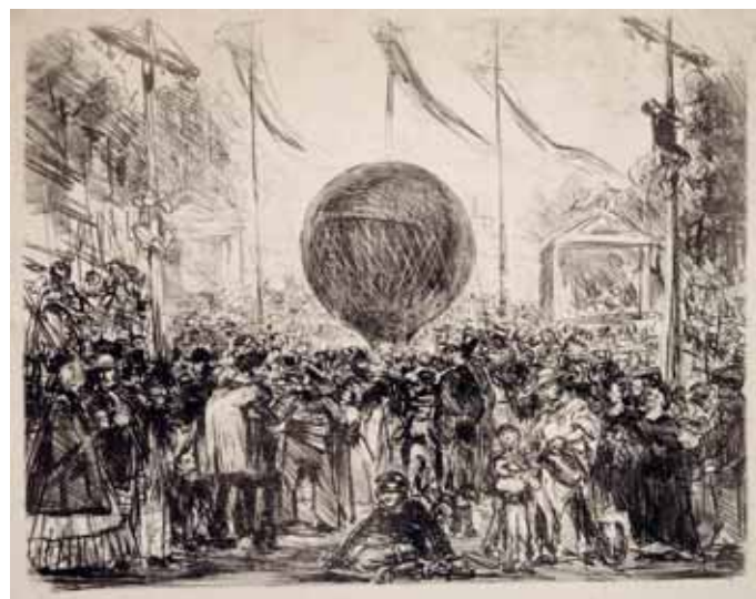
Fig. 2. Edouard Manet, The Balloon , 1862, lithograph in black on laid paper, state trial proof, National Gallery of Art, Collection of Mr. and Mrs. Paul Mellon