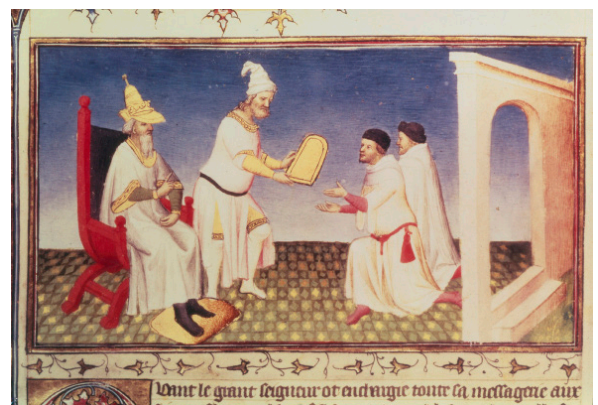
Fig. 3. Kublai Khan giving his golden seal to the Polos at his new capital Cambaluc, from the Livre des Merveilles , c. 1413. Ms 2810, f. 3v., Bibliothèque National, Paris, France, ©Art Resource, NY