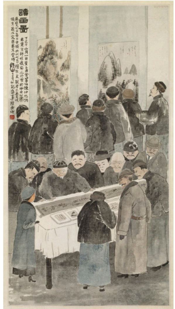
Fig. 2. Chen Shizeng (1876–1923), Viewing Paintings (1917), hanging scroll on paper, Palace Museum, Beijing

Each of these projects adopts methods from a new global art history, including GIS mapping, statistical analysis, cultural anthropology, and colonial theory, in ways that enrich the whole field. At the same time, the encounter with the unfamiliar world of Chinese art history has revived interest among fellows working on European and American art in such issues as reception, historical and philosophical context, political patronage, the power of institutions, and even connoisseurship and formal analysis, all of which have risked becoming overly familiar and, perhaps, stagnant. Understanding the long and complicated history of Chinese culture and viewing it through other lenses may put in perspective the presentism of much current interest in contemporary global art. • Elizabeth Cropper, Dean, Center for Advanced Study in the Visual Arts