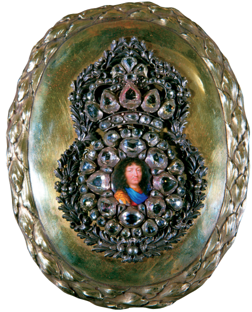
Fig. 2. Jean Petitot, Gioiello della Vita , second half of the seventeenth century, enamel on metal with diamonds, set in gold, Azienda USL di Bologna, Museo della Storia di Bologna, Genus Bononiae-Fondazione Carisbo