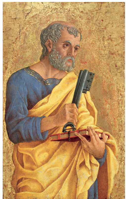
Fig. 3. Marco Zoppo, Saint Peter , c. 1468, tempera on panel, National Gallery of Art, Samuel H. Kress Collection