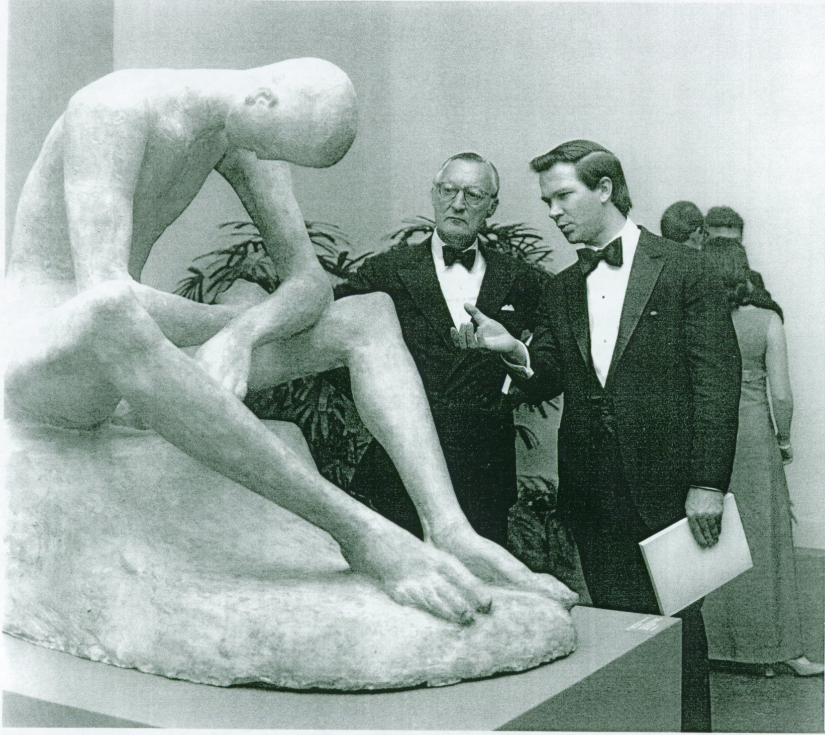
Scan of photocopy of photograph. Photocopy of photograph is located in the Press Release files.