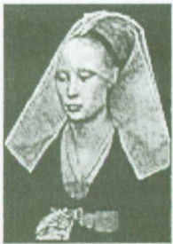
Rogier van der Weyden, Portrait of a Lady , c. 1460

Northern Analogues: Several northern European works in this exhibition are included for comparison. An especially beautiful example is Rogier van der Weyden's Portrait of a Lady (c. 1460) in which he abandons the traditional profile and depicts the sitter in three-quarter view. The artist also utilizes a half-length format, allowing him to include the sitter's hands in a pose which captures the dignity and modesty of the lady. A pair of devotional panels by Petrus Christus, Portrait of a Male Donor (c. 1455) and Portrait of a Female Donor (c. 1455), also utilize the more progressive three-quarter view and demonstrate the growing international character of 15th century portraiture in northern Europe and Italy.