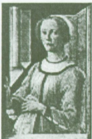
Sandro Botticelli, Woman at a Window (Smeralda Brandini?) , c. 1470/1475

Botticelli Group: The exhibition includes four works by Sandro Botticelli. The earliest, Woman at a Window (Smeralda Brandini?) (c. 1470/1475), depicts the sitter in informal dress and hairstyle standing before a window. In an attempt to convey the physical and psychological presence of his sitter, Botticelli, like Leonardo, has departed from the more traditional profile in favor of the three-quarter view. His portrait Young Woman (Simonetta Vespucci?) in Mythological Guise (c. 1480/1485) appears to portray a legendary beauty who tragically died young. Her features—golden tresses, partly loose and partly braided, and pearly white skin, reflect the ideal type of female beauty for the time. The Botticelli group also contains two striking male portraits, Giuliano de' Medici (c. 1478/1480) and Young Man Holding a Medallion (c. 1485), that are both related to the female portraits.