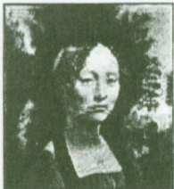
Leonardo da Vinci, Ginevra de' Benci , c. 1474-1478

Medals: Portrait medals, reflecting the ancient tradition of commemorative medallions and coins, flourished in the courts of northern Italy. Representations of female sitters, mostly the daughters and wives of rulers, were common. Pisanello (Antonio Pisano), whose medal Cecilia Gonzaga (1447) can be seen in the exhibition, is credited with inventing this art form. The practice of medals reached Florence in the 1470s. One of the most graceful of all the Florentine medals created is on view, Giovanna degli Albizzi Tornabuoni (c. 1486), attributed to Niccolò Fiorentino. It can be compared to Domenico Ghirlandaio's portrait of the same sitter, also in the exhibition.