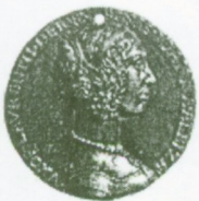
Attributed to Niccolò Fiorentino, Giovanna degli Albizzi Tornabuoni , c. 1486

Early Florentine Profiles: As the 15th century progressed, portraits of females, independent of men, increased in popularity. Filippo Lippi created portraits of women that were the first of their kind in Renaissance Florence. The exhibition features his two surviving masterpieces of the genre, Woman with a Man at a Window (c. 1438/1444), and Profile Portrait of a Young Woman (c. 1450-1455). Both works depict the sitter facing left, establishing the standard profile type for portraying Florentine women. An additional early Florentine profile in the exhibition, A Young Lady of Fashion (c. 1460/1465), is attributed to Paolo Uccello and exemplifies the mid-15th century treatment of female portraits in which the sitter's individuality is suppressed in favor of the social ideals for which she stands.