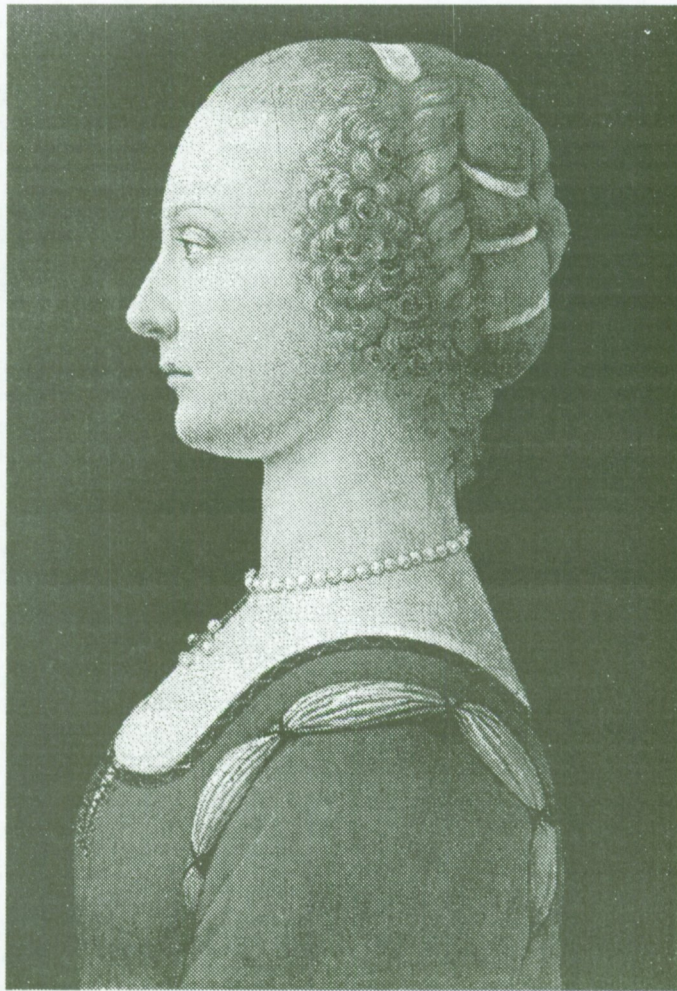
10 Giovanni Bastianini, Portrait of a Lady , "Giovanna Albizzi," National Gallery of Art, Washington, Andrew W. Mellon Collection