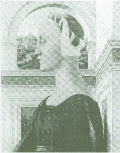
8 Imitator of Piero della Francesca, Portrait of a Lady , Museum of Fine Arts, Boston, Lucy Houghton Eaton Fund, 1940