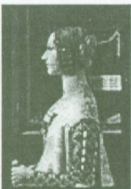
Domenico Ghirlandaio, Giovanna degli Albizzi Tornabuoni , c. 1488/1490

Ghirlandaio Group: Like Leonardo and Botticelli, Domenico Ghirlandaio was committed to the three-quarter view, which he used for the Portrait of a Lady (c. 1480/1490), and the Portrait of a Young Man (c. 1490), part of a diptych portrait which also includes a female in profile. Ghirlandaio, however, retained the traditional profile view for what is perhaps the most admired and discussed of all the Florentine portraits, his Giovanna degli Albizzi Tornabuoni (c. 1488/1490). This portrait repeats the profile of the same sitter in a fresco scene painted by the artist in the Tornabuoni Chapel of the Church of Santa Maria Novella in Florence. Both likenesses are posthumous, representing the sitter after her tragic death in childbirth. This special circumstance may explain Ghirlandaio's departure from the three-quarter view.