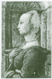
Filippo Lippi, Profile Portrait of a Young Woman , c. 1450-1455

Ruler Portraits: Independent portraits of women were rare prior to the mid-15th century. They often depicted a prospective partner for a royal or noble marriage. More common for the time were ruler portraits depicting both husband and wife. These portraits were likely executed in the traditional profile view because of its association with ancient coins and medallions. Examples of this portrait type can be seen in the beginning of this exhibition.